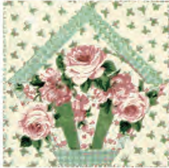
Block No 7: Wicker Basket No 3