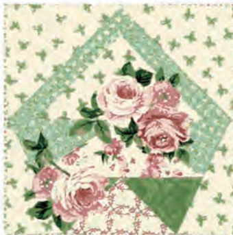
Block No 5: Fancy Basket