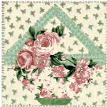
Block No 1: Striped Basket