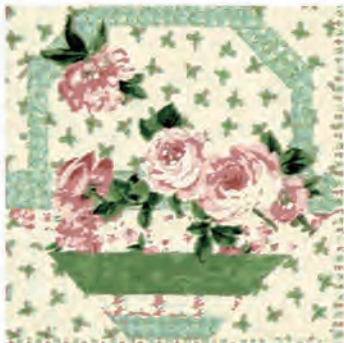
Block No 4: Wicker Basket No 2