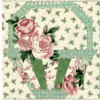
Block No 8: Flower Basket No 2