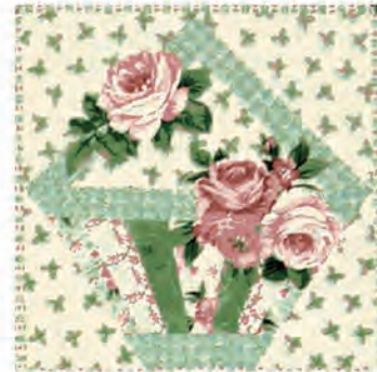
Block No 3: Wicker Basket No 1