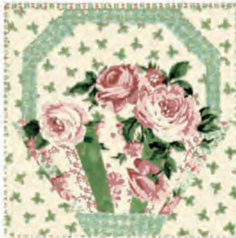
Block No 2: Easter Basket