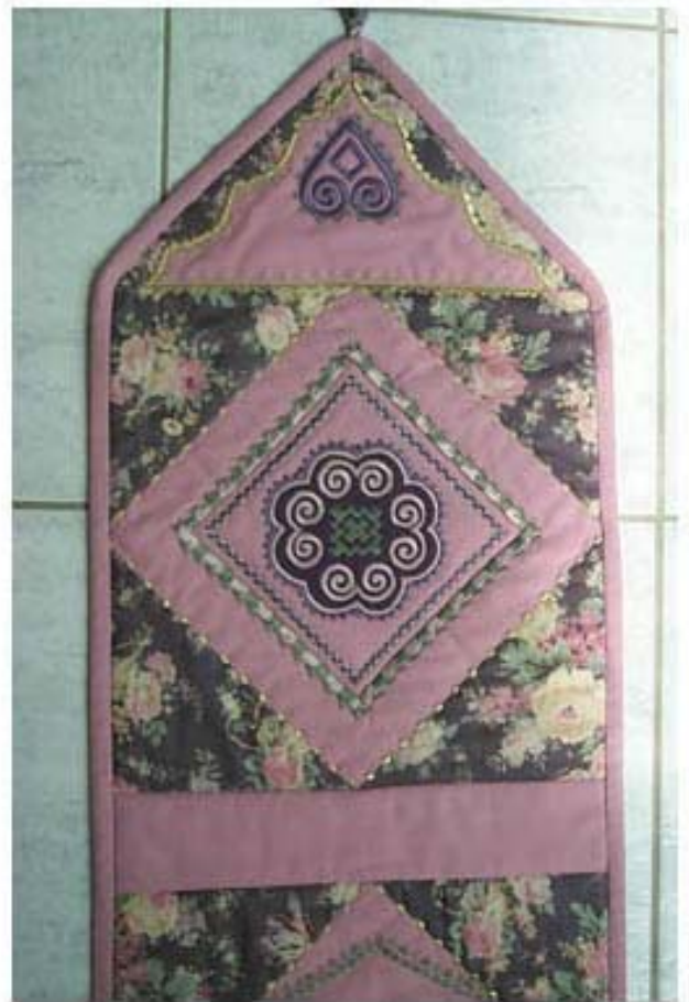
Embroidery From The Heart Table Runner - 2 Day Class